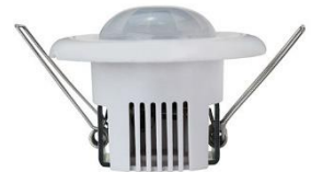
Small motion sensor